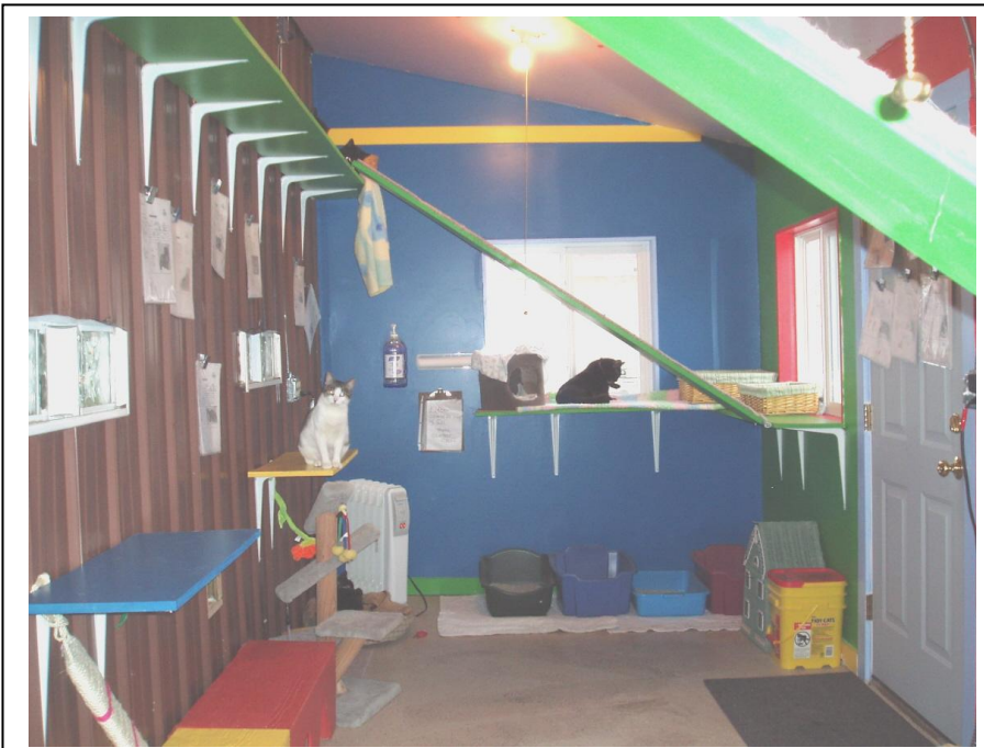
The Existing Community Cat Room

Even though FMAR's existing facility is in good shape, the Cat Haven will be instrumental in reducing the stress levels in cats and dogs. The currently facility houses the cats and dogs in the same area, so they can see one another. Unfortunately, the constant view of the cats really aggravates some of the dogs. As a result, a dog will spend most of the day barking. Along those lines, our community cat areas are at capacity as well. And our older cat residents in the community cat room often resent the teenage residents.