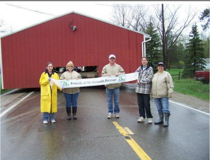
The Day the Barn was moved.