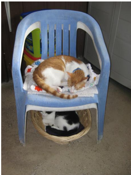
Cats In our Community Cat Room

The Cat Haven will take care of both these issues. First, the dogs