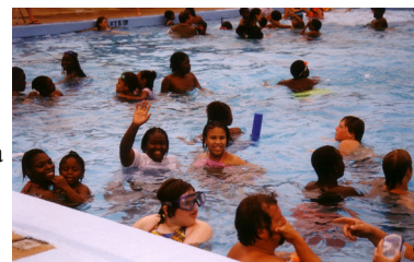
Cooleemee residents cool off at the United Way Day on June 12, 2004

For more information contact the DCUW office at 751-0313.