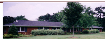
The Duke Street Supported Living Program provides housing for developmentally disabled.

Two residents of the Duke Street Supported Living Program are part of North Carolina Partners in Policymaking. They go to Raleigh every month for meetings and to meet legislators with the